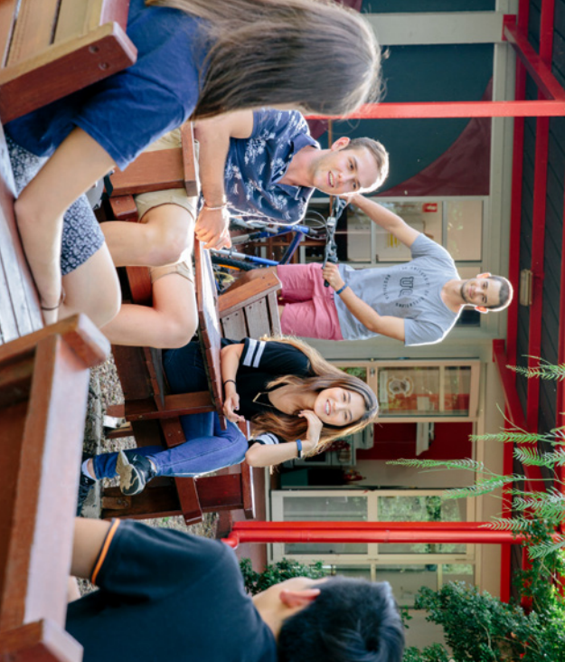
PF-COL AUG 2023